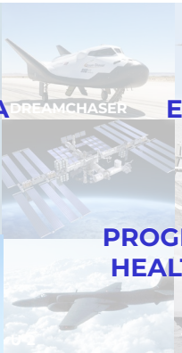
PROGNOSTIC & HEALTH DATA