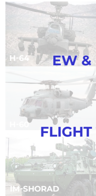
EW & ISR